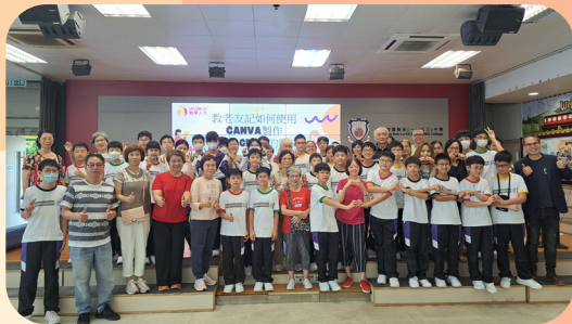
中一級活動 -- 與耆同學

活動當日，師生反應熱烈，氣氛融洽。學生在活動中展現不同面貌，師生關係更加密切，氛圍愈加和諧，成功達成促進了解與關係融洽的目標。