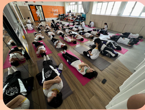
中三級活動 -- Chill — Chill