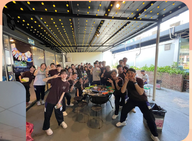
中五及中六級 -- 燒烤樂