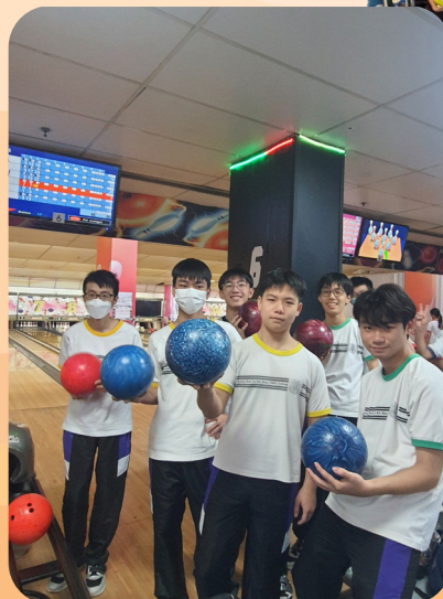
中四級活動 -- 一起打保齡球