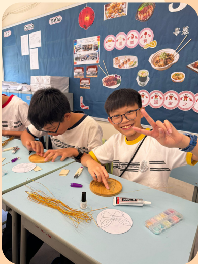
中二級活動 -- 製作手工杯墊